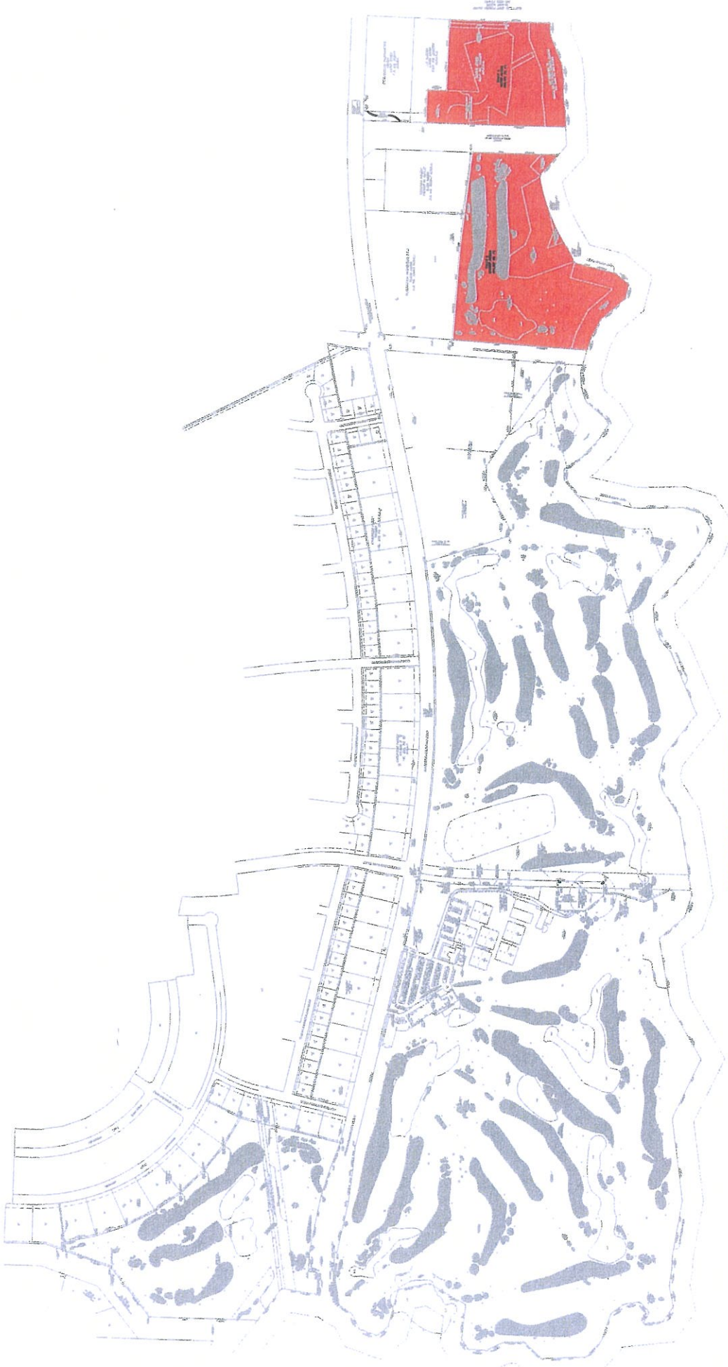
CYPRESS FOREST PUD 32.66 ACRE-TRACT WITHIN THE RAVENEAUX GOLF COURSE